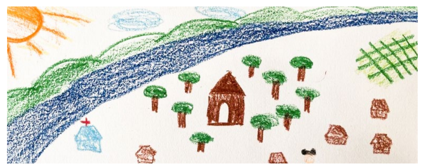
Illustration from the Children Consultations for the 2023 Global Refugee Forum in Thailand