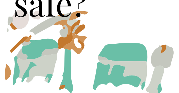
Illustration from the Children Consultations for the 2023 Global Refugee Forum in Thailand

"Mom and Dad stayed on land, and we children went on the boat. The boat was rocking, and then people with masks came...I was afraid."