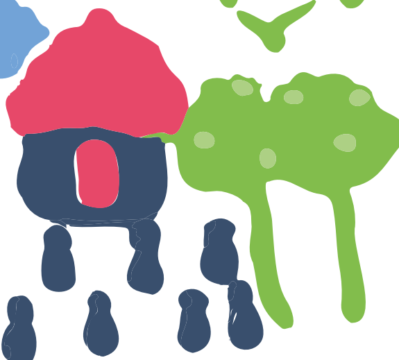
Illustration from the Children Consultations for the 2023 Global Refugee Forum in

"I was very sick. It was night, my father took me to the hospital. They didn't ask me anything except if I had an ID card. I didn't have an ID, and they didn't help me. I cried. The worst thing is when I don't have an ID card, I can't do anything. I can't even buy a bus ticket to go to another city." Refugee boy, 15